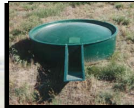
8' x 2' x 8' 750 gallons Above Ground