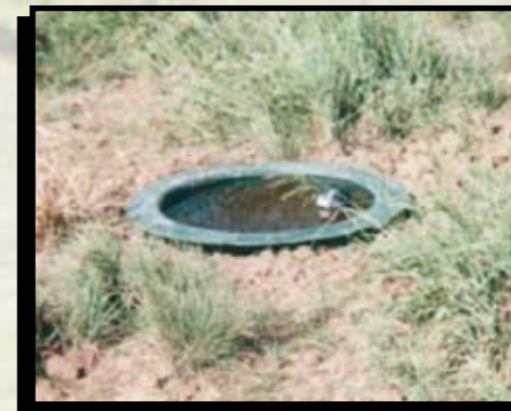
2' x 1' with Float Accessories