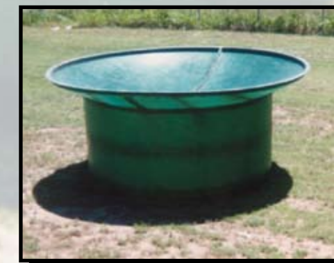
12' x 6' x 16' 5000 gallons