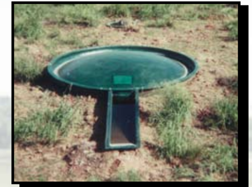
8' x 2' x 8' 750 gallons Ground Level