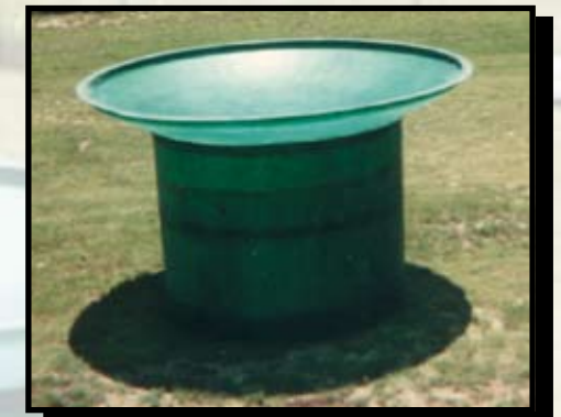
8' x 6' x 12' 2200 gallons